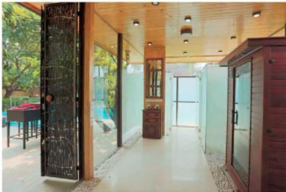
There is a modern touch to the farmhouse, too! Beside the pool, tall metal doors lead into a spa area with steam and sauna rooms, and a small gym space.

A gazebo here not only adds to the aesthetic charm, but also lends itself as a great spot to convene and have lazy laid-back conversations over a cuppa. "Due to Surat's hot and humid weather, it was always important for us to design ample covered spaces. But we also wanted to take advantage of the natural breezes, and hence we went with a semi-covered gazebo," explains Shah.