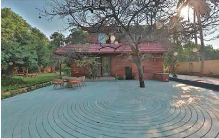
The open court in the backyard, paved with concentric circles of Kota stones, doubles up as a spacious party hub