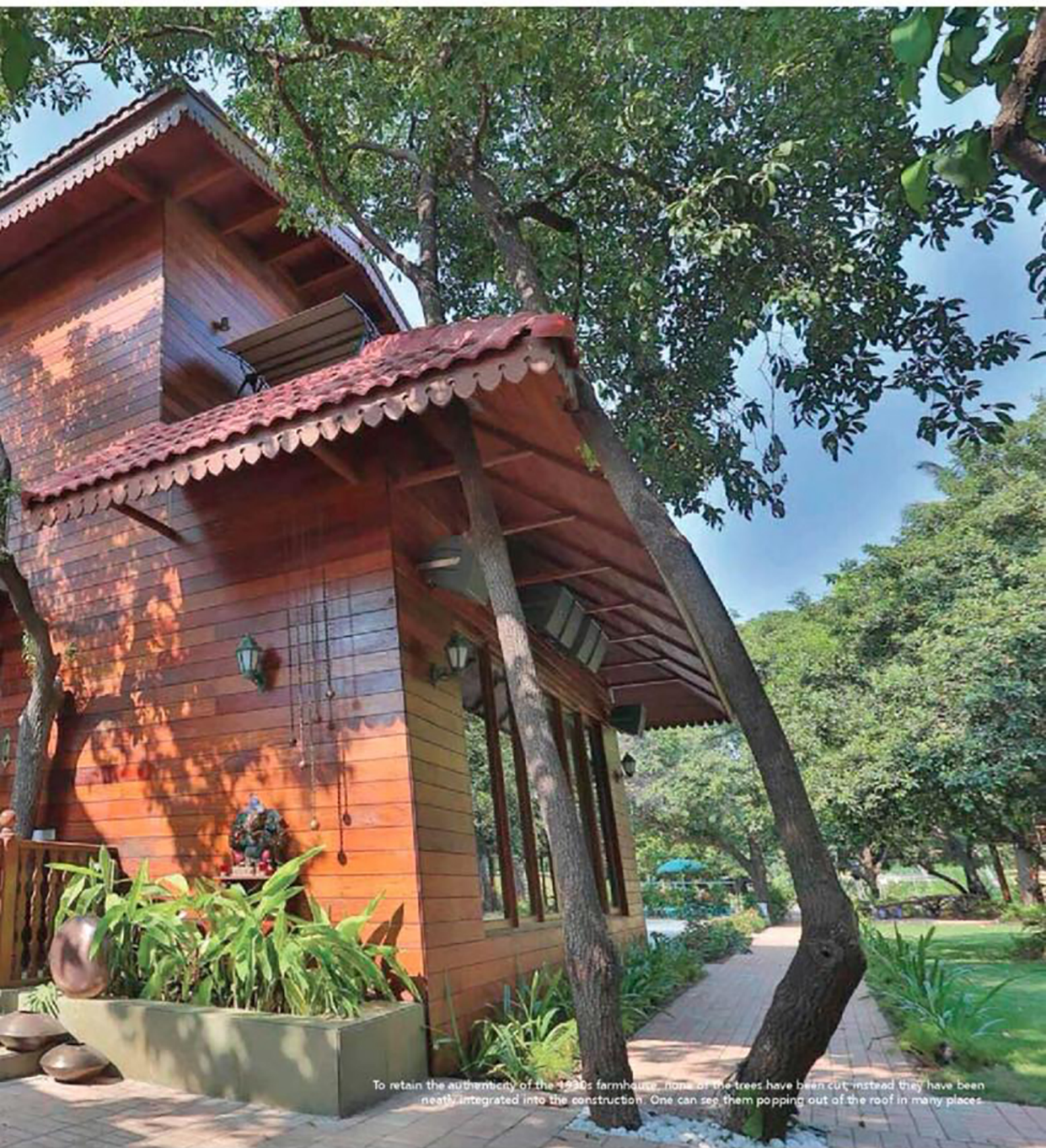
To retain the authenticity of the 1930s farmhouse, none of the trees have been cut; instead they have been neatly integrated into the construction. One can see them popping out of the roof in many places.